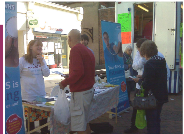
Sign Up roadshow in Havant Market